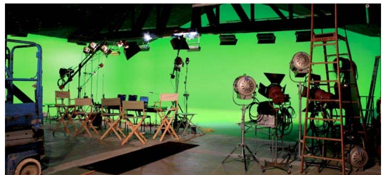
IMAGE TV OHIO production is located in Downtown at Creative House Studios, Inc. The largest Green Screen Studio in Northeast Ohio.

Please contact OCAGC for sponsorship level, pricing and benefit. All Sponsorship is Tax Deductible