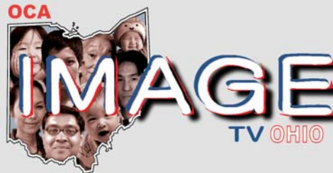
IMAGE TV OHIO, a High Energy Magazine-styled 30 minutes Television show. IMAGE TV OHIO will focus on local Asian-American influence (Economic, Social, Arts and Cultural Development). The show will provide the community at large a better understanding of Asian culture. Each episode will include segments on a variety of diverse topics related to economic, education, culture, traditions, food, health and beauty, fashion, sports, arts and entertainment, news, and current issues as well as upcoming events.